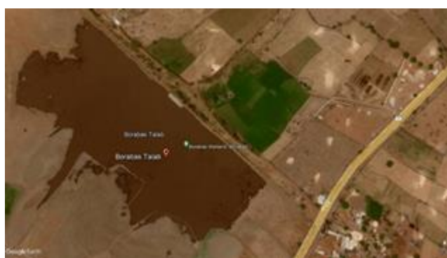
Fig. 1- Google map showing Borabas pond

Borabas village ( 25^{\circ}01'37.98''\text{N} , 75^{\circ}41'42.21''\text{E} ) is situated 30km. and Alania dam ( 24^{\circ}59'48.85''\text{N} , 75^{\circ}51'52.23''\text{E} ) is situated 25km. away from Kota. There are many water birds like Greater flamingo, Painted stork, Sarus crane, Asian open-bill stork, Woolly-necked stork, Black stork, Red-naped ibis, Black-headed ibis, Glossy ibis, Great white pelican, Cormorants, Eurasian curlew, Black tailed godwit, Bar-headed goose, Ruddy shelduck, Knob-billed duck, Pied avocet, Kentish plover, Yellow-wattled lapwing, Indian courser, Oriental pratincole, Small pratincole, Little tern, Indian skimmer, Black kite, Peregrine falcon, Marsh harrier etc.