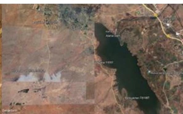
Fig. 2- Google map showing Alania dam